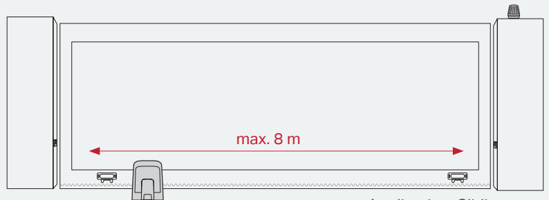
Application: Sliding gate