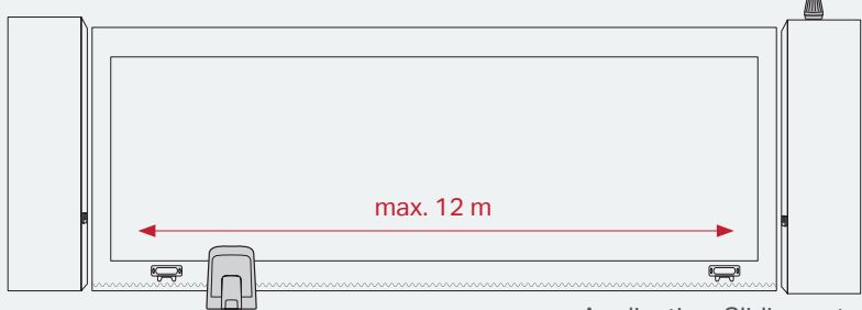
Application: Sliding gate